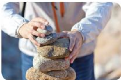
Proof of concept for sustainable structure