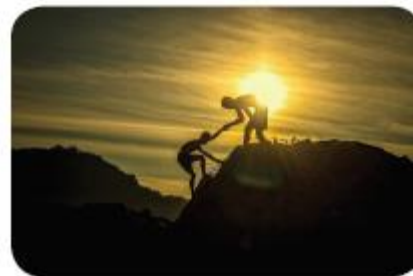
Strengthen health information capacity