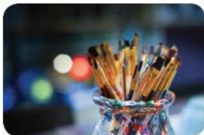
Tools and methods for health information support