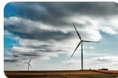
Assessing and piloting interoperability for public health policy