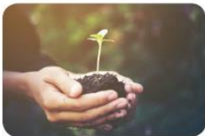
Integration into national policies and sustainability