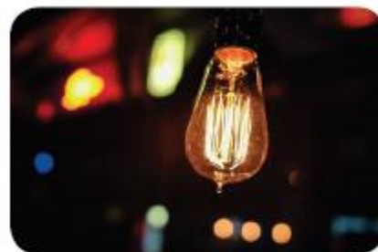
Innovation in health information for public health policy development