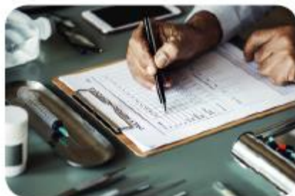
Status of health information systems in the EU