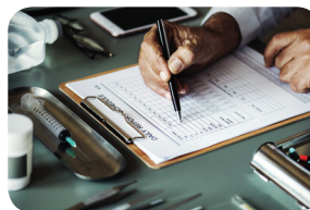
Status of health information systems in the EU