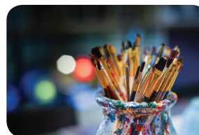
Tools and methods for health information support