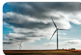
Assessing and piloting interoperability for public health policy