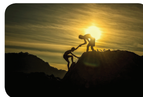
Strengthen health information capacity