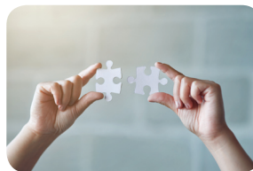
Coordination, Evaluation and Dissemination

InfAct activities are carried out by the following work packages: