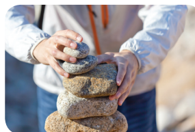
Proof of concept for sustainable structure