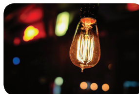
Innovation in health information for public health policy development