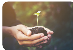
Integration into national policies and sustainability